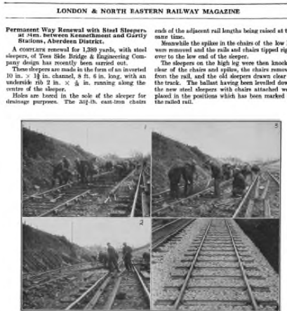
Renewing the permanent way with steel sleepers: Aberdeenshire District

The "Starbuckham Express" (taken by Capt. J. S. Somers, D.M.S. 48206 27211 "36000" Exp.).